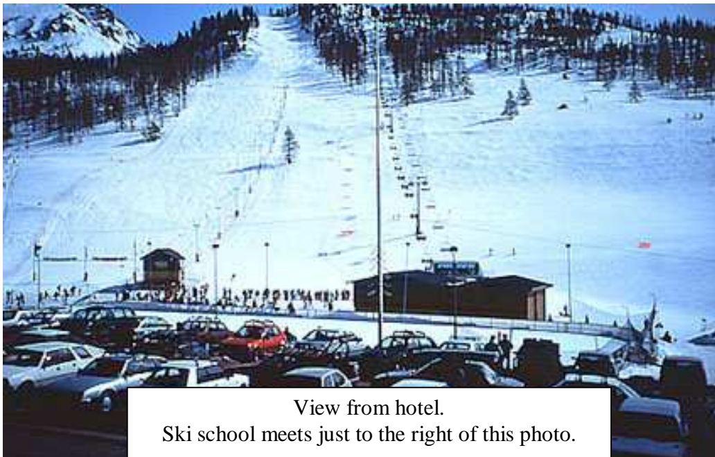
View from hotel. Ski school meets just to the right of this photo.