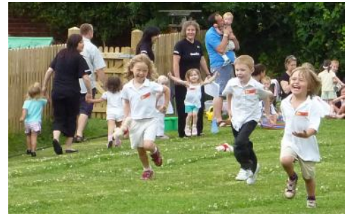
Nursery Children, Form I & II stay in the Sports Hall for their races